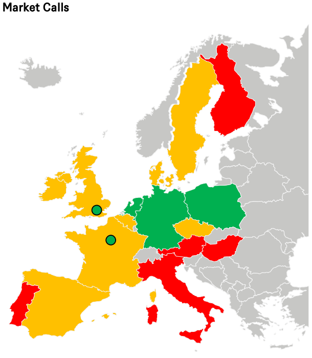
Note: Based on DWS in house real estate return five-year forecasts for office, logistics, residential and shopping centres. Green = Positive, Orange = Neutral, Red = Negative

We said six months ago that relative to other markets the correction in Germany had further to run. This indeed turned out to be the case, but today the market is starting to look more attractively priced. And while the economy does face the prospect of recession, low vacancy and moderating Bund yields both point towards a period of strong performance across the German Big-7.