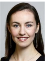
Siena Golan Property Market Research

This information is subject to change at any time, based upon economic, market and other considerations and should not be construed as a recommendation. Past performance is not indicative of future returns. Forecasts are not a reliable indicator of future performance. Forecasts are based on assumptions, estimates, opinions and hypothetical models that may prove to be incorrect. Investments come with risk. The value of an investment can fall as well as rise and your capital may be at risk. You might not get back the amount originally invested at any point in time.