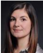
Rosie Hunt Property Market Research

This information is subject to change at any time, based upon economic, market and other considerations and should not be construed as a recommendation. Past performance is not indicative of future returns. Forecasts are not a reliable indicator of future performance. Forecasts are based on assumptions, estimates, opinions, and hypothetical models that may prove to be incorrect. Investments come with risk. The value of an investment can fall as well as rise and your capital may be at risk. You might not get back the amount originally invested at any point in time. Source: DWS International GmbH.