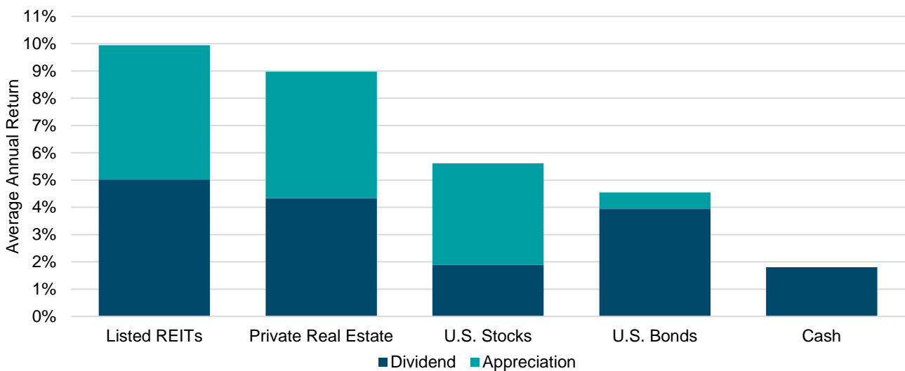
EXHIBIT 2: AVERAGE ANNUAL DIVIDEND AND APPRECIATION BY ASSET CLASS (1999-2018)

Sources: Federal Reserve 90-day Treasury Bill (Cash); Bloomberg/Barclays U.S. Aggregate Bond Total Return Index (U.S. Bonds); S&P 500 Total Return (U.S. Stocks); FTSE/NAREIT All Equity REITs Total Return Index (Listed REITs); NCREIF Property Index (Private Real Estate). As of December 2018.