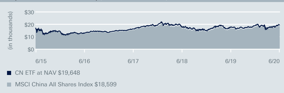
ETF performance and index history (from 6/30/15 to 6/30/20)

Includes reinvestment of all distributions.