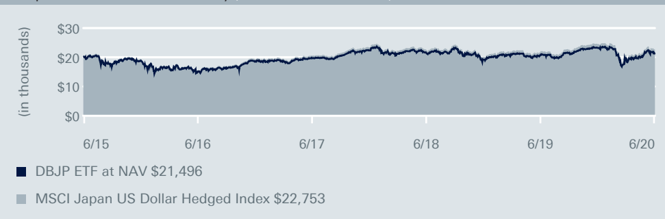
ETF performance and index history (from 6/30/15 to 6/30/20)

Includes reinvestment of all distributions.